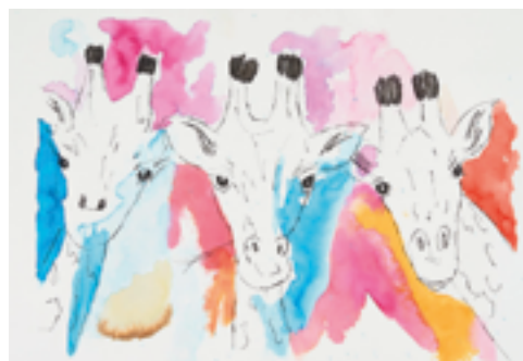
Oh Hello, HMP & YO1 Parc, Highly Commended Award for Drawing